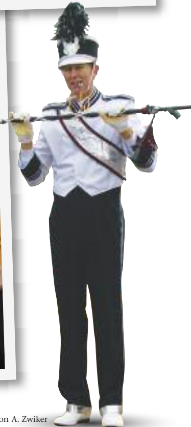
Edisto Beach Christmas Parade